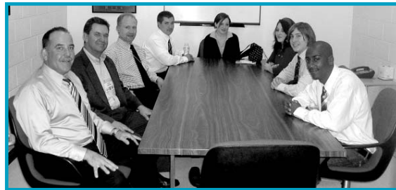
Bristol Tech Ed faculty, local business participants and students start a dialogue at the first luncheon discussion on October 10th.